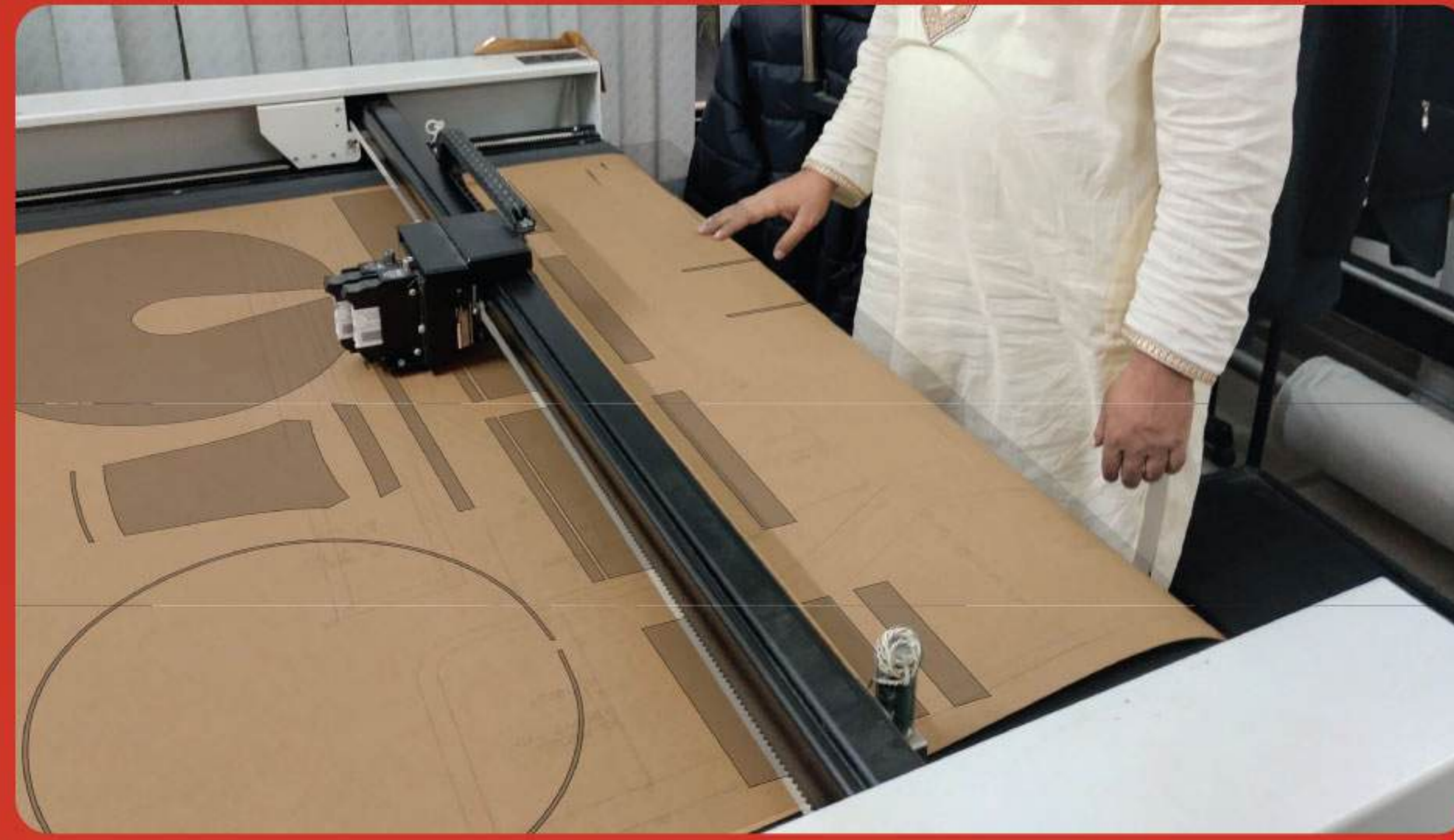
INHOUSE PATTERN MAKING