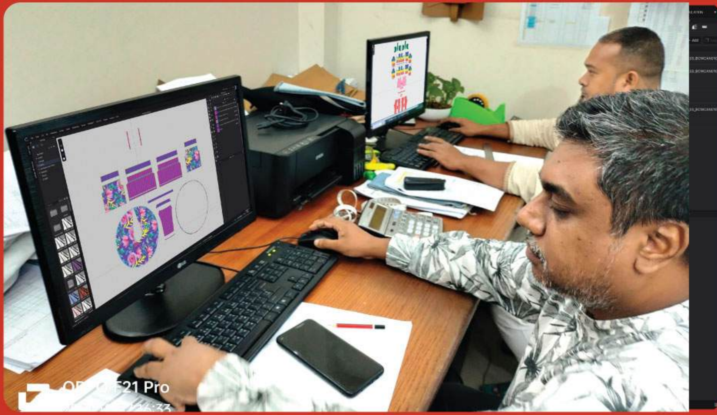
INHOUSE CAD SYSTEMS